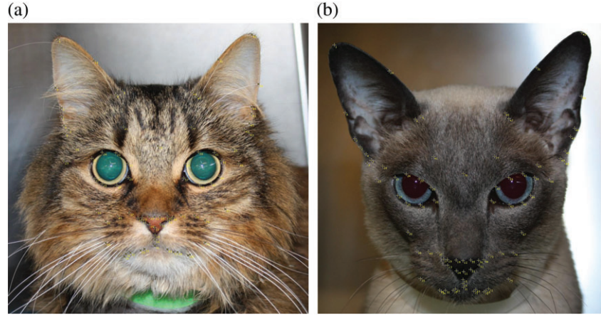
FIG 1. 2D facial images of cats used to develop faces descriptors. Thirty-six paired (right and left face) and six single anatomical landmarks were identified to allow for measurement between points. (a) Domestic shorthair with landmarks. (b) Pedigree with landmarks

Sixteen feline facial images were presented in a PowerPoint presentation in no particular order to a group comprising veterinary surgeons, veterinary nurses, students and support staff (n=68). The photographs presented were from the two groups of images collected as outlined in study 1. Seven images were from the pain-free (control) group (NRS=0) and nine images were cats from the subsequent group of cats rated to be in pain (NRS=1 or greater) by the attending veterinarian using an NRS. Images were displayed for 10 seconds and each respondent marked on a score sheet whether they thought the cat was painful, yes or no, based