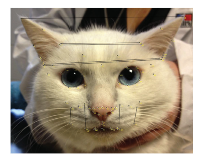
FIG 2. Portrait depicting identified distances significantly different between painful and pain-free cats

Individual mouth distances on average were statistically significantly different (P<0.05) between pain-free and painful cats. The standardised mouth distances showed good discrimination, the percentage correctly classified between pain-free and painful cats was 81%. There were five ear distances identified, three showed statistically significant differences between control and painful cats and when standardised, the four standardised ear distances were all statistically significant (note that four standardised distances as the fifth was used as the standardisation). The standardised ear distances showed good discrimination between the pain-free and painful cats, the percentage correctly classified between pain-free and painful cats was 95%. The standardised mouth and ear distances when combined showed excellent